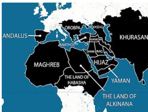
ISIS releases map of 5-year plan to spread from Spain to China

ISIL primarily claimed territory in Syria and Iraq, subdividing each country into multiple provinces. Throughout the years 2014 and 2015, ISIS also announced that they plan to gain the territories of North Caucasus, Nigeria, Southern Afghanistan, and Yemen.